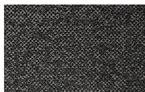
graphite bo & lf