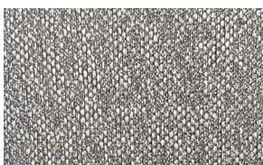
stone bo & lf