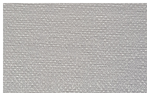
smoke bo & lf