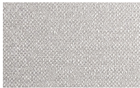
pearl bo & lf