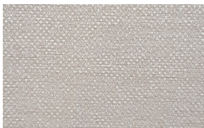
linen bo & lf