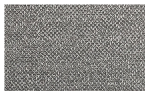
grey bo & lf