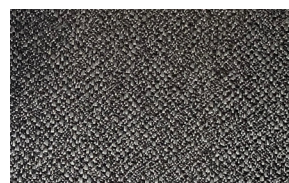
onyx bo & lf

N.B. - Colours may vary from the digital representation.