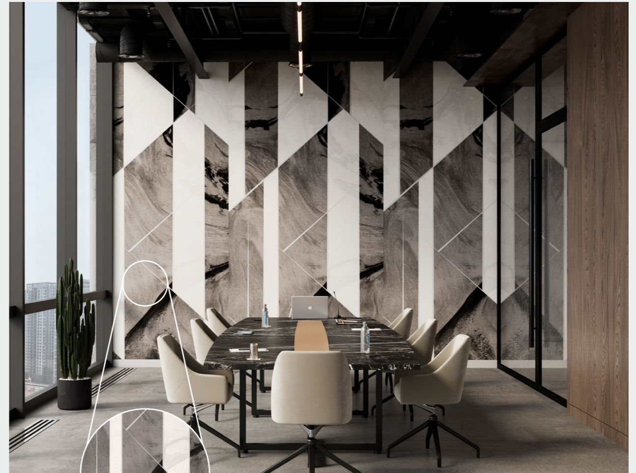
Louis - Sand

To view the full 1912 collection and order samples