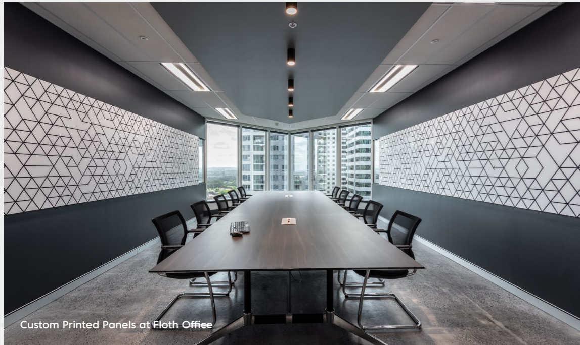
Custom Printed Panels at Floth Office