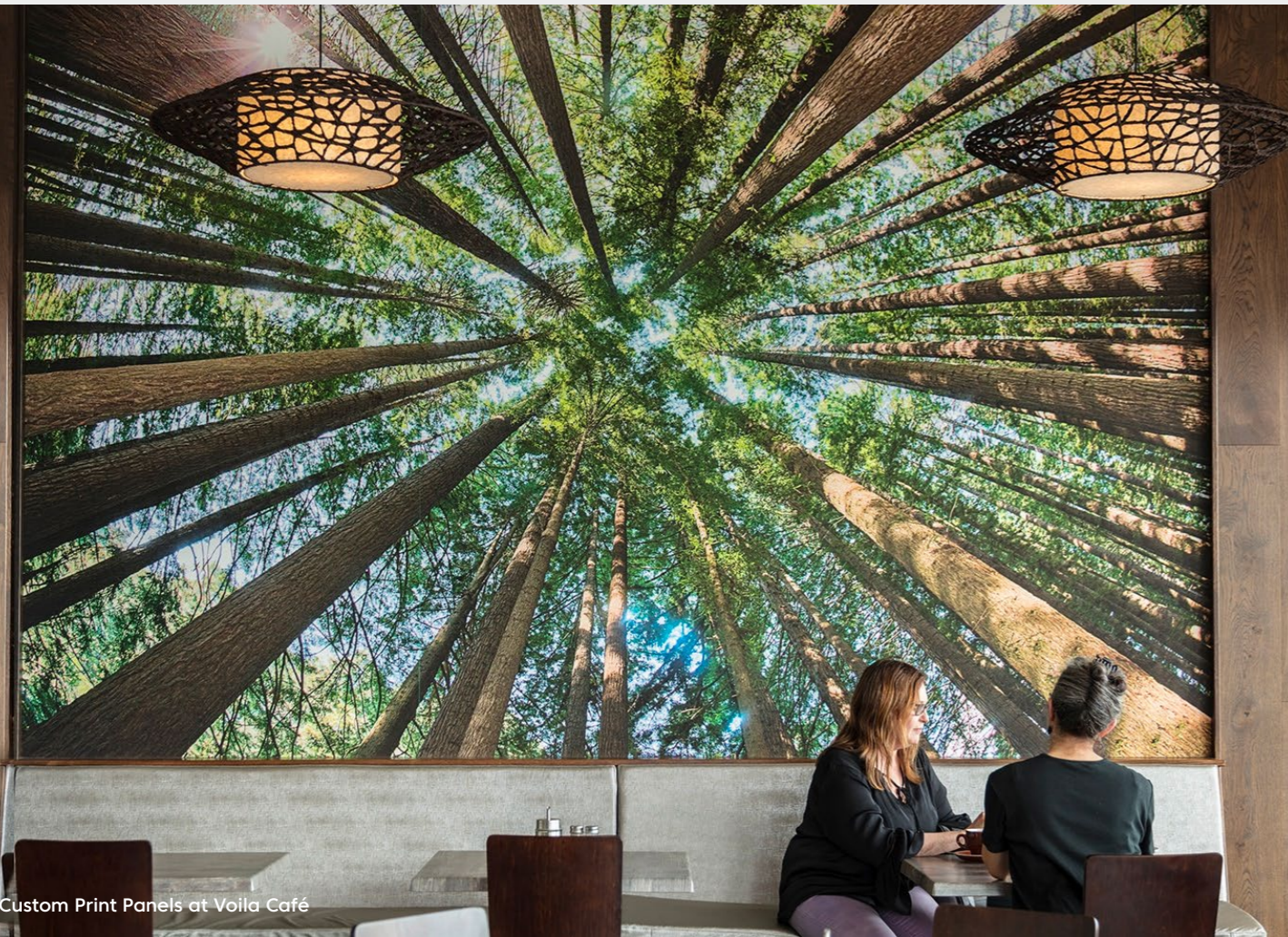
Custom Print Panels at Voila Café