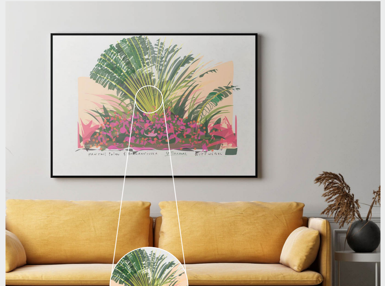
Fantail Palm and Bouganvillea

To view the full Acoustic Art collection and order samples