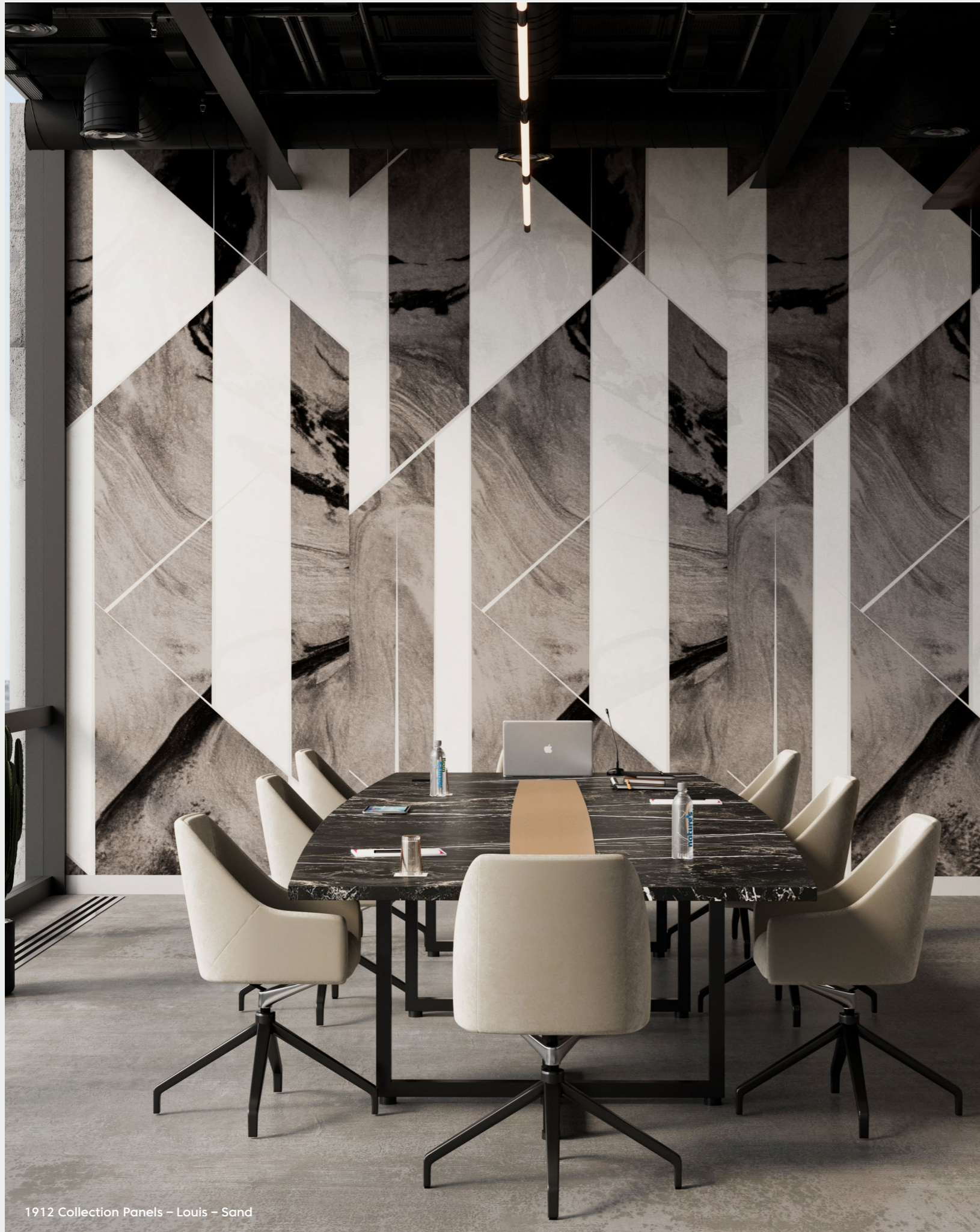
1912 Collection Panels – Louis – Sand