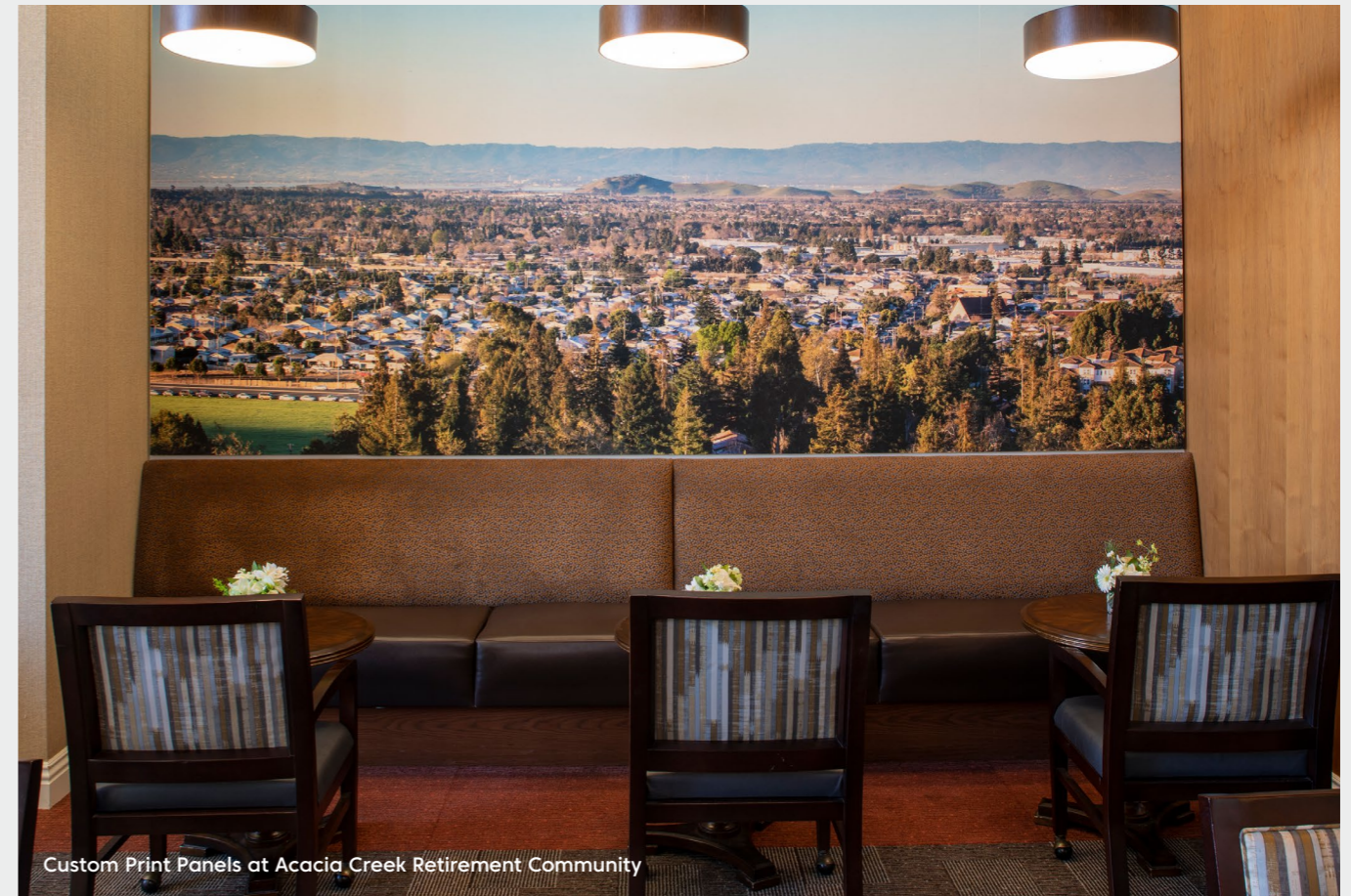
Custom Print Panels at Acacia Creek Retirement Community